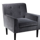
Century Chair $869.55 each